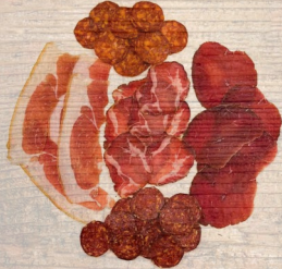
Local meats & charcuterie