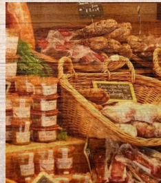
Over 40 unique stalls