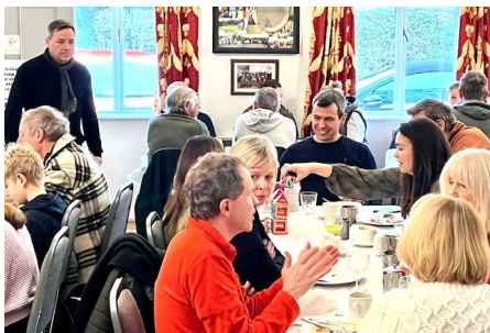
Some of the customers indulging