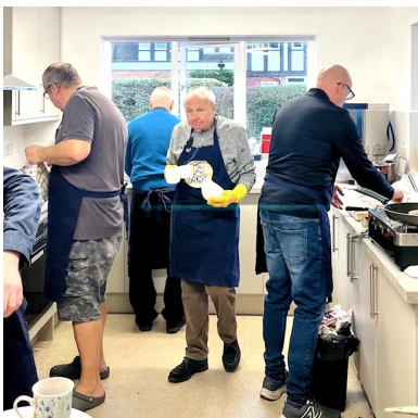
Some of the Big Boys in action

(And on behalf of the community, a very grand and sincere 'thank you' to all the Big Boys for continuing this much-loved annual tradition!)