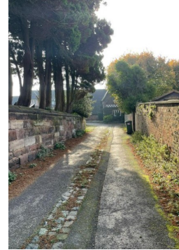
Southbank before ...

... to all the villagers who undertook the long-overdue task of clearing weeds