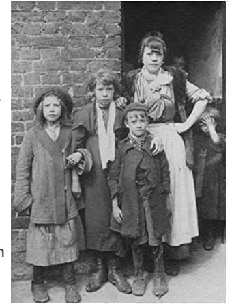
A Victorian slum-living family