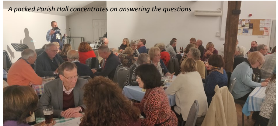
A packed Parish Hall concentrates on answering the questions

Well, what an intellectual, entertaining and sold-out evening it was! FULL MARKS to the Big Boys and the Parish Hall management for arranging the event, even if the same could not be said for some of the teams! Multiple teams representing aspects of the village and various interest groups answered (or attempted to answer) 80 questions, ranging from the truly difficult to the somewhat more approachable under