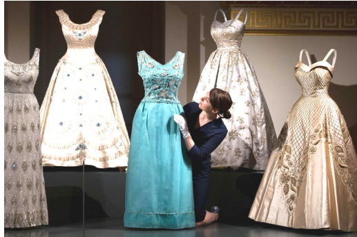
Some examples of the late queen's evening gowns

[See page 15 for reports on the WI Book Club and WI Ramblers.]