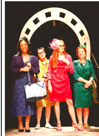
A scene from 'Ladies Day'

The book club are reading 'The Promise' by Damon Galgut. It's a story that takes in over 30 years of the Swart family in South Africa, with all their trials and tribulations.