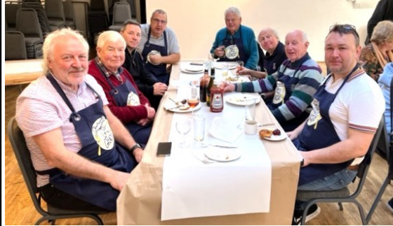
The Big Boys sit down to enjoy their breakfast — eventually.

The Big Boys' Breakfast held on Sunday 5th February proved a great success.