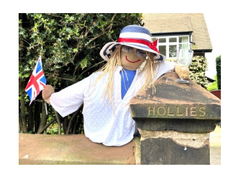
THOSE MAGNIFICENT SCARECROWS