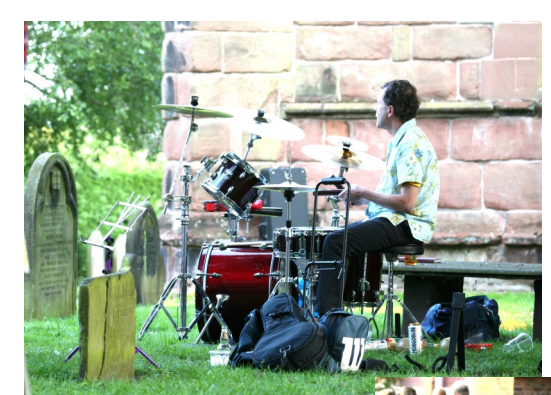
BEER, BANGERS & BAND PARTY