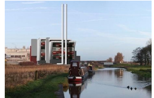
Artist's impression of the proposed incinerator plant

Michael Gove, Secretary of State, now has an application on his desk asking for an increase in the annual amount of waste to be burnt at the Incinerator at Lostock from 600,000 tonnes to 728,000 tonnes.