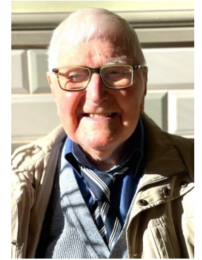
Pictured whilst enjoying a coffee in Northwich, just four days before his death

He was, and will remain, one of the true characters of Great Budworth, and will no doubt be sorely missed.