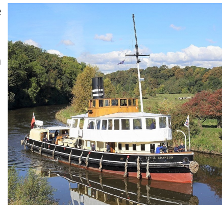
Steamship 'The Danny'

We also recently had a talk by the Blood Bikers, who transport blood and organs from hospital to hospital. They have bought another bike, which they asked the Cheshire WI to name, as Blood Bikers have received so many generous donations from the WIs they have visited. The new bike has been named "Denman WI" after Lady Denman and the college, which has now closed.