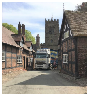
Above and below: recent incidents involving HGVs