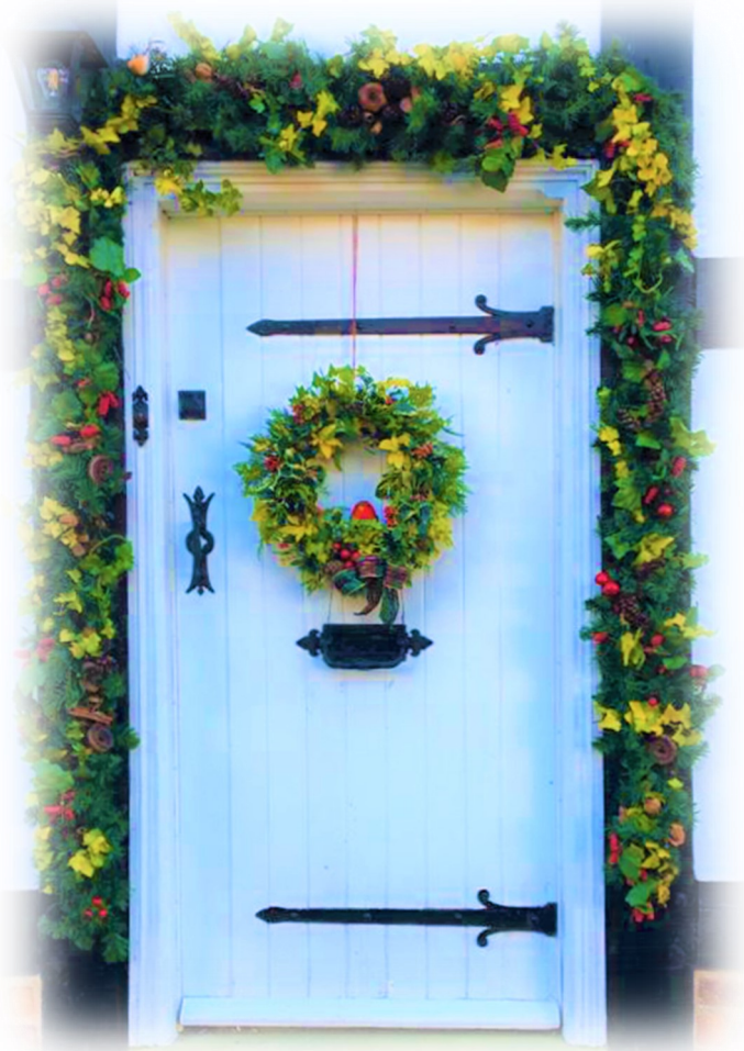
Bakery Cottage, High Street, Christmas 2019

Wishing all our readers a very happy Great Budworth Christmas