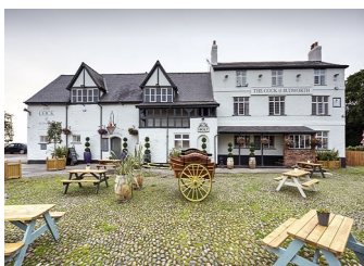
The Cock O'Budworth Warrington Rd, Great Budworth, CW9 6HB 01606 891287