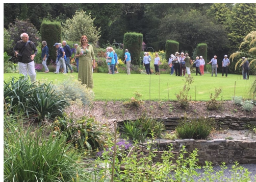
Members enjoy the beauty of Llwyngarreg Garden

Our August trip was a full day out by coach to RHS Harlow Carr at Harrogate. It is a great garden, full of interesting features and herbaceous borders, with wonderful autumn colour. There were two famous Betty's Tea Shops, in which members could enjoy various menus or just have a Fat Rascal, a speciality Yorkshire scone!