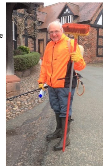
The Chairman of the Heritage Society dressed for work.