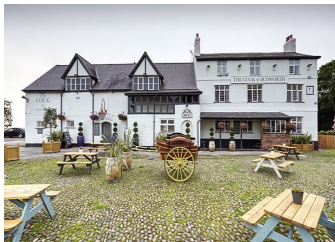
The Cock @ Budworth Warrington Rd, Great Budworth, CW9 6HB 01606 891287