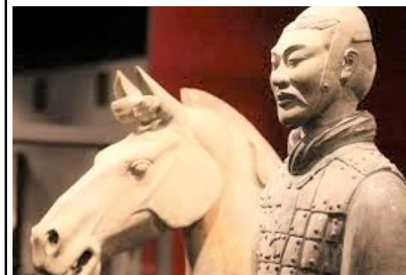
One of the exhibits at the Liverpool Museum

The ramblers enjoyed a walk around the Arboretum at Swettenham before going on towards Kermincham, then back via the Ford to the Swettenham Arms for lunch. It was a lovely day and a lovely walk. The next walk is on Tuesday 9 th October, leaving the village at 10am.