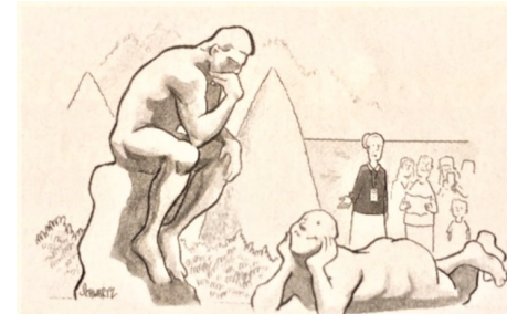
"And you can also see Rodin's lesser-known The WhatchaThinkinBout-er"