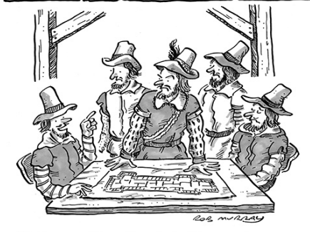
"Before we blow the whole thing up, have you thought about proposing a referendum?"