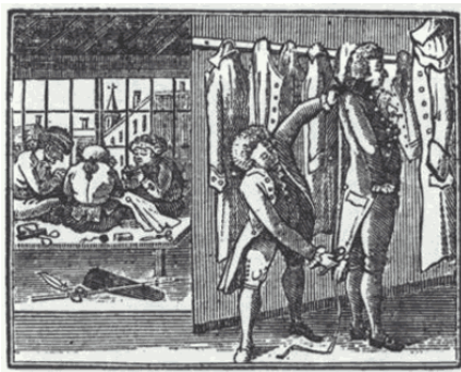
A gentleman being measured for a coat in an eighteenth century tailor's shop