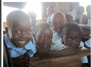
So happy to be at school